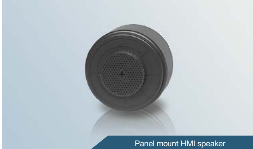
Panel mount HMI speaker

Voice alerts are given so that an operator away from the system can notice the alerts. Voice volume and language can be selected according to the operating environment.