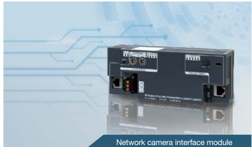
Network camera interface module

Using this product with an HMI (GOT) enables checking images recorded by cameras, controlling camera shooting directions, or recording images when a downtime occurs.