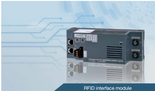
RFID interface module

Managing the number of uses of the life-expired parts by RFID and replacing the parts before the production line stops can reduce the risk of production line downtime.